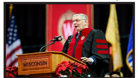
UW alum and former Commissioner of Baseball Bud Selig speaks during the winter commencement ceremony at the University of Wisconsin-Madison